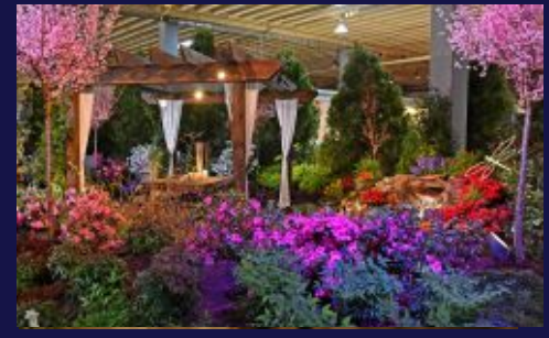
Indiana Flower and Patio Show Indianapolis, IN