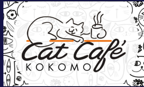
Kokomo Cat Cafe Kokomo, IN