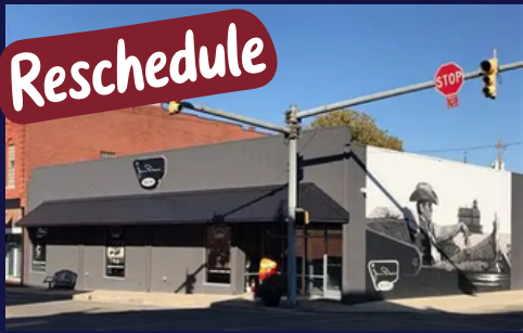
James Dean Museum Fairmount, IN