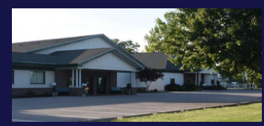
Tipton County Event Center